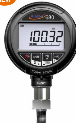
680 pressure gauge