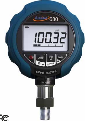
680 with rubber boot (Optional)